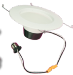
5" & 6" Downlights