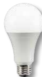
17/10/6 W A21 3 Way