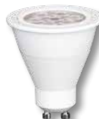
7W GU10 MR16