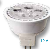
6.5W GU5.3 MR16