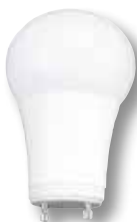
10W GU24 A19