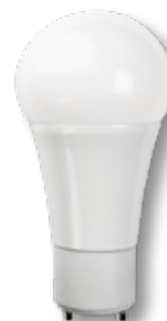
17.5W GU24 A21