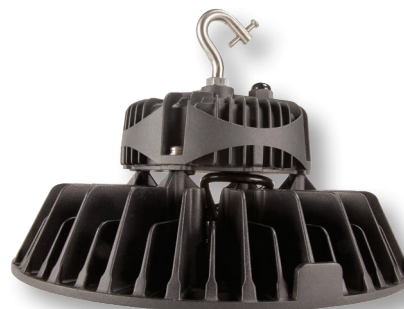
LED Round High Bay

Input Line Voltage ..... 120-277V & 277-480V Input Line Frequency (Hz) ..... 50/60HZ Wattage (W)..... 100W/150W/200W/240W Lumens (L)..... 15000L/22500L/30000L/36000L Lumens per Watt (LPW)..... >150 LPW Rated Life..... 50,000 hours Minimum Starting Temperature .....-30°C (-22°F) Maximum Operating Temperature..... 50°C (122°F) CRI ..... >80 Power Factor ..... >0.95 THD..... <20% Ratings ..... cULus wet location rated, IP65 Controls..... 0-10V dimming (standard)