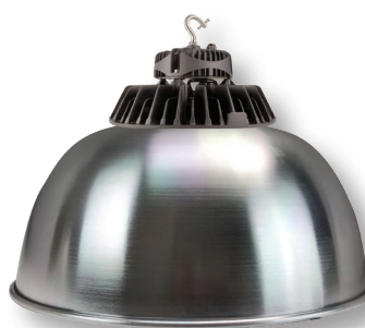
LED Round High Bay with aluminum reflector