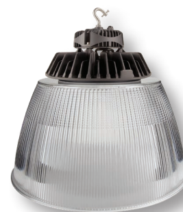
LED Round High Bay with acrylic refractor